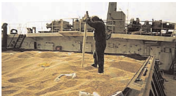
Probing aluminium phosphide in retrievable sleeves into a bulk cargo

This is the reason why fumigation with phosphine is almost always carried out during the voyage (intransit) so that the voyage time can be used to ensure a fully effective treatment.