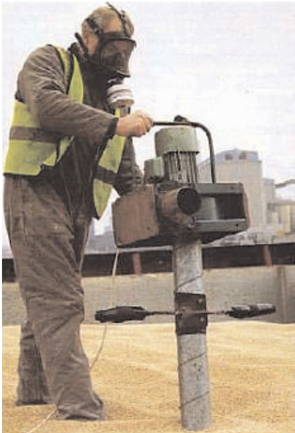
Ventilating the cargo prior to discharge