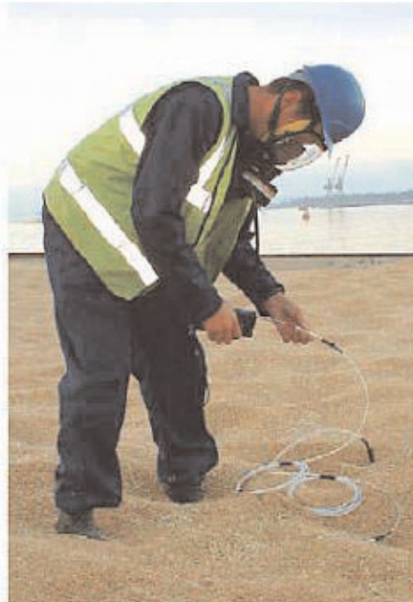
Checking the gas concentrations in the cargo prior to discharge