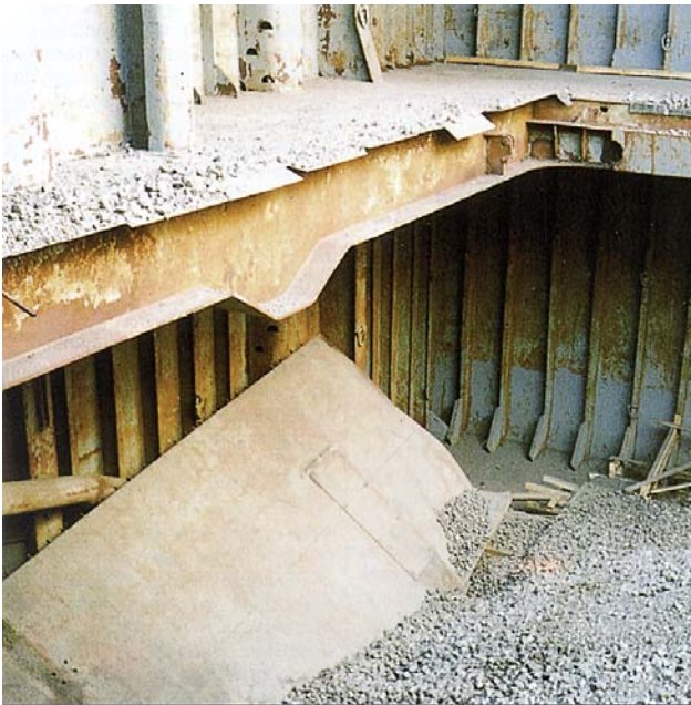
A collapsed tween deck

generated by the stack load. For instance, a single stack of 2 x 20ft x 20 tonne units will exert a down loading of 40 tonnes. Beneath each corner casting, the point loading will be about 345t/m 2 . Failure to appreciate the magnitude of such stresses has sometimes resulted in tank tops becoming pierced, followed by flooding of the hold by fuel oil or ballast water.