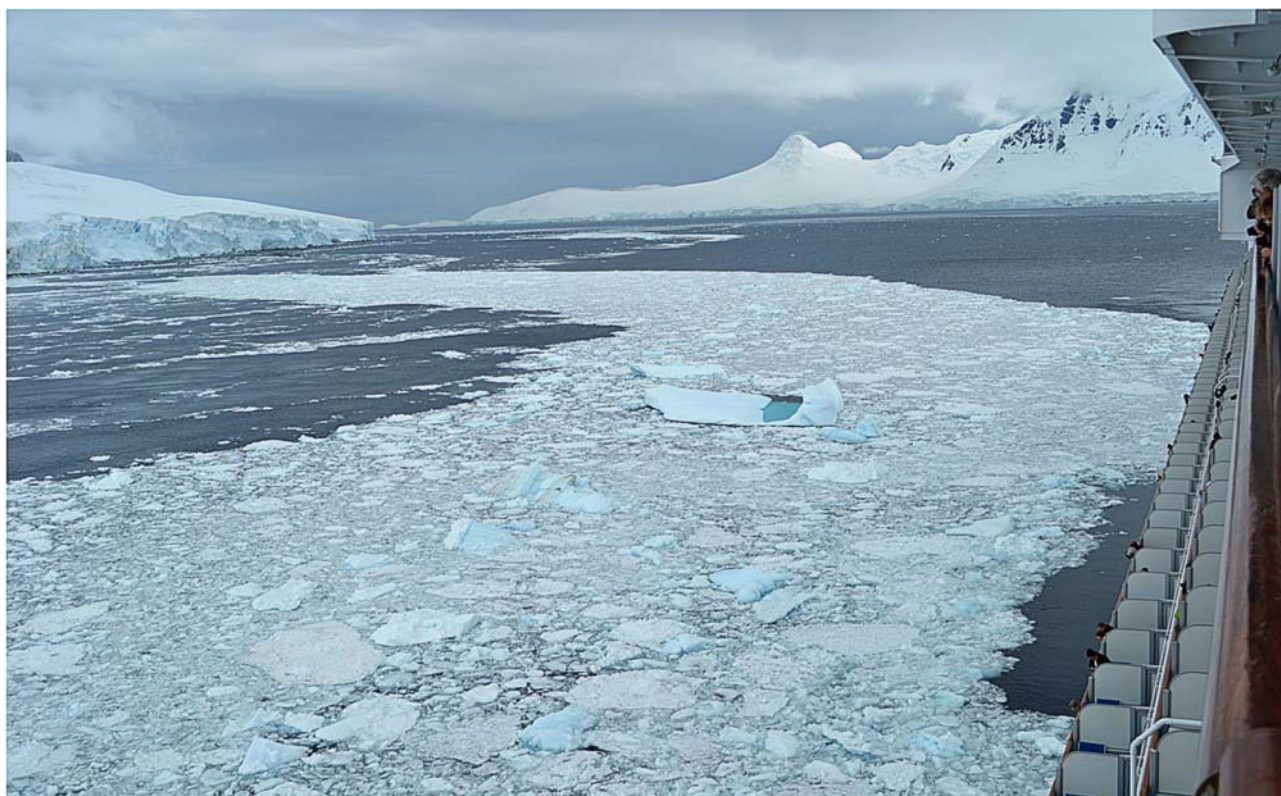
Photo Neumayer Channel - Antarctica

The legal effect of failure to meet the statutory ECDIS requirements and the effect on claims where levels of operation or knowledge of ECDIS are considered to be a factor or fundamental link in the chain of causation leading to an incident