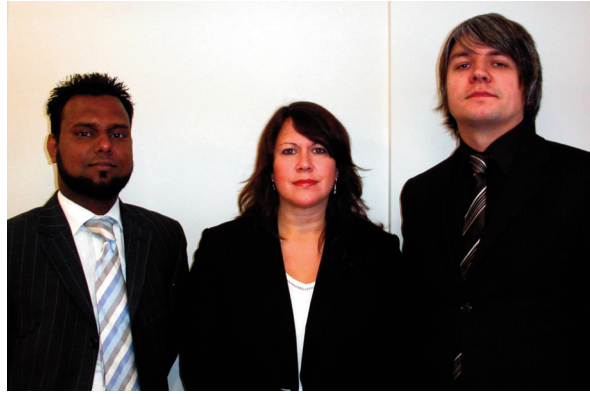
PEME Team (from left to right)

The UK Club delivers a service of proven added value to the Club's existing membership through its PEME programme. It has become a key element in the Club's loss prevention scheme.