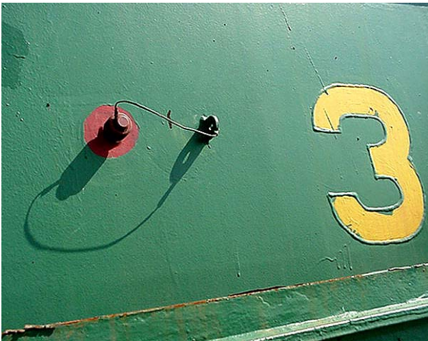
Gas sampling point

2.2.1 In order to obtain meaningful information about the behaviour of this cargo in a cargo space, gas measurements shall be made via one sample point per cargo space. To ensure flexibility of measurement in adverse weather two sample points shall be provided per cargo space, one on the port side and one on the starboard side of the hatch cover or hatch coaming. (Refer to the diagram of gas sampling point.) Measurement from either of these locations is satisfactory.