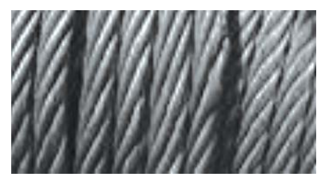
Rope buried in amongst lower layers