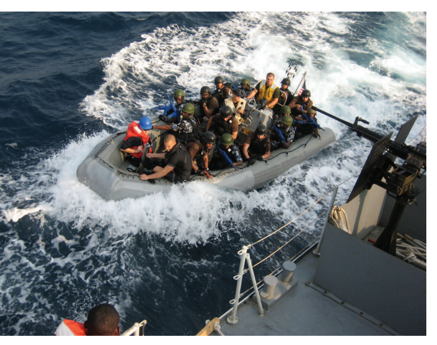
Nigerian special forces training with US sailors to combat the increasingly violent pirate attacks along the West African coast. The 530 miles (853 kilometres) of Nigerian coastline is a lucrative target for pirates. Energy company vessels crowd the waters off the oil-rich Niger Delta, which provides the US with one of its top sources of crude oil for gasoline.

Shipping companies will need not only to protect their vessels but also to ensure that they can still attract high-quality officers and crews willing to sail in the area. This means that crews must understand but not overestimate the risks, and that they and their families are mentally and physically prepared for an incident. Seafarers should understand how best to look after themselves and their fellows if they are kidnapped. Companies must be able to demonstrate that they take their duty of care seriously, and that they will be able to act professionally if a kidnap does occur.