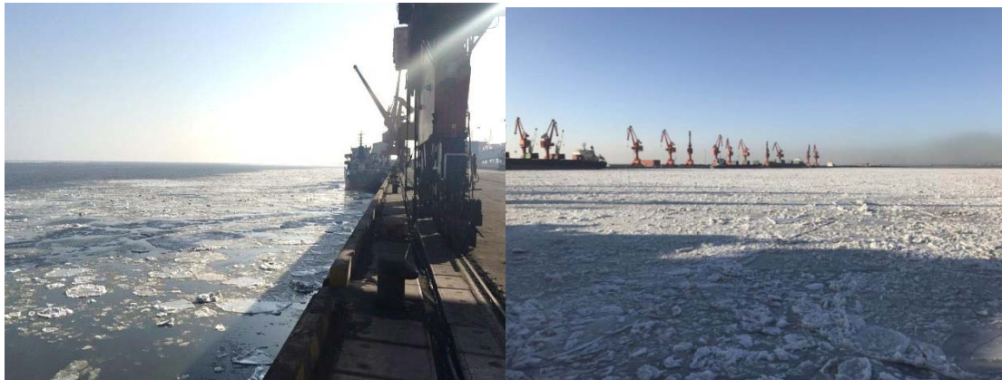
(Photos taken at Dalian port: floating ice are observed at harbor basin, channel and anchorage)

Operations at these ports are in normal condition. There is no ice breaker at North Liaodong Bay, and big tugs are used to break big pieces of ice in the harbor basin near by the shore as well as around the channel to ensure safe navigation.