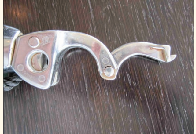
▲ Figure 5: View of normal snap shackle in open position