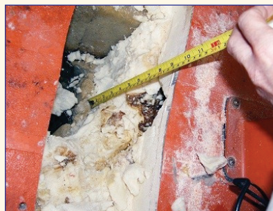
◀ Figure 3: Water seen in buoyancy space between inner and outer fiberglass skins of rescue boat

During the investigations, it was also unexpectedly discovered that water had entered the foam-filled buoyancy spaces between the inner and outer fiberglass skins of the rescue boat's hull (Figures 3 & 4). The craft was found to be approximately 450 kg overweight. Although the additional weight of water caused the davit's SWL to be exceeded, it was established that this would not have caused the wire to fail.