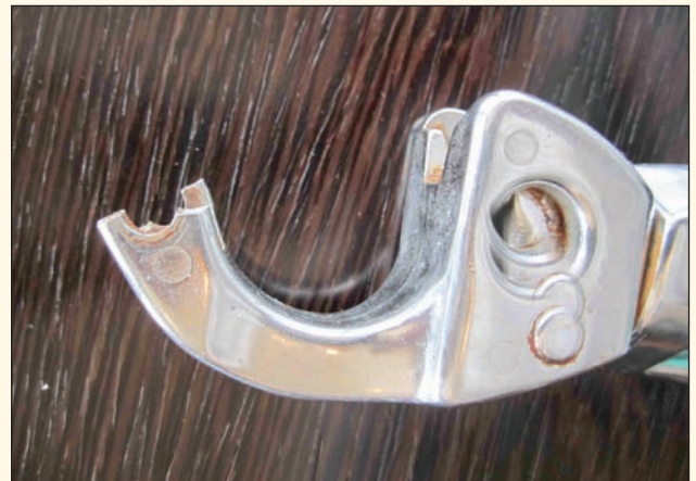
▲ Figure 6: View of broken snap shackle