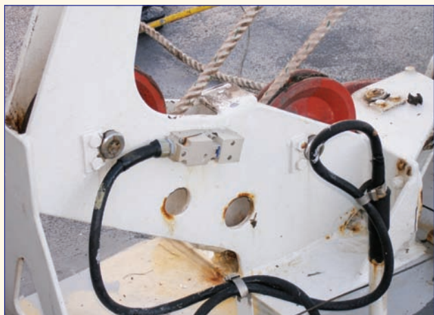
▲ Figure 1: View of proximity sensor/limit switch arrangement on davit (Note cable entry gland position raised above horizontal, potentially permitting ingress of water)

The crew of a large vehicle carrier was concluding a routine launching drill of the rescue boat in port. As the craft was coming up to its normal stowage position, a proximity sensor/limit or cut-off switch arrangement (Figure 1) that was designed to cut electrical power to the winch motor failed to operate correctly. With the davit having come up hard against its stops, the hoisting motor continued to wind in the fall wire, causing it to part. The rescue boat and its four crew fell nearly 29 metres into the water. One of the boat's crew died and two were hospitalised.