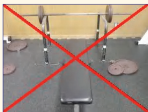
◀ Figure 7: Hazard: Barbell left on stand and weights left loose on deck can cause injury and damage