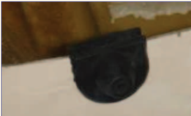
▲ Figure 1: Example of an intact bushing

The main function of the bushing is to allow the unimpeded streaming of the painter line. When attempting to launch and inflate an improperly repacked liferaft, the painter line may come out of the bushing and get jammed between the two halves of the outer container, which prevents it from being fully drawn out. The liferaft will then become impossible to inflate, either automatically or manually.