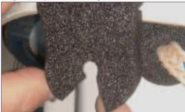
▲ Figure 2: Example of a radially cut bushing

There have been a number of reported incidents where inflatable liferafts have failed to inflate in emergencies, including one in Swedish waters, which led to the loss of three lives. It is thought that a cut bushing could have been a contributing factor in these occurrences.