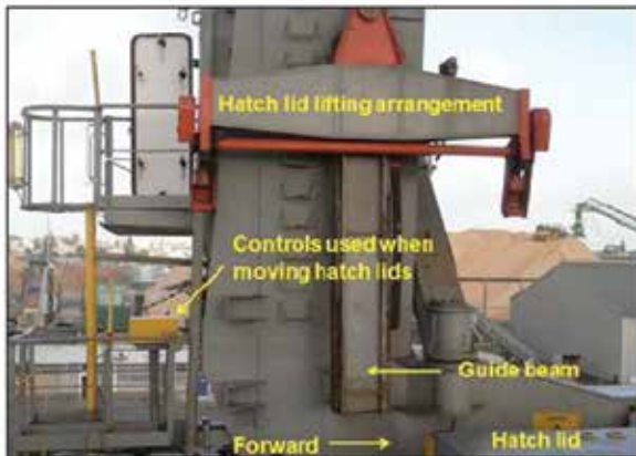
Hatch lifting assembly and guide beam shown next to a single stacked hatch lid