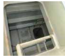
Access trunking where OS was found

Unfortunately, the atmosphere inside the trunking was only checked some 24 hours after the accident; Oxygen and carbon monoxide levels were found to be normal.