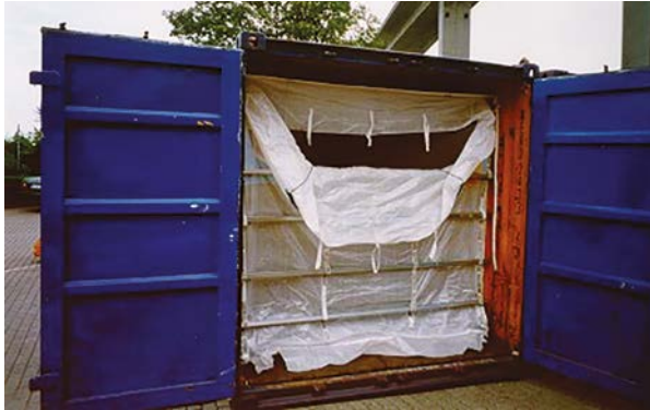
Figure 28.1: A liner bag fitted in a container for stowage of coffee.