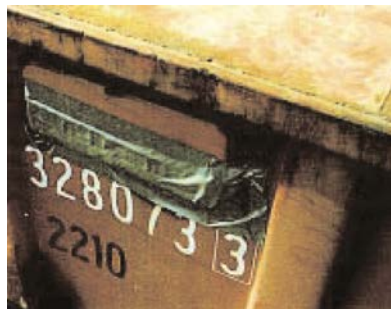
Figure 28.3: Sealed ventilation openings.