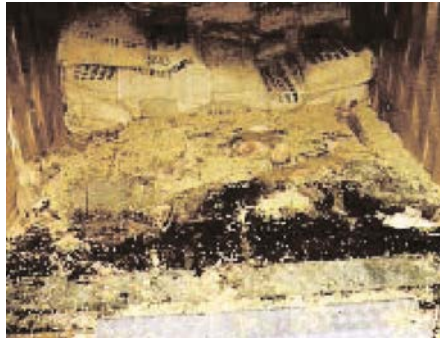
Figure 28.4: Water has penetrated through all the openings.

When loaded with 300 × 60 kg bags, minimal space remains and in this case the cargo is more prone to condensation damage. There is no obvious scientific explanation for this phenomenon but it is well substantiated. Although ships' crew cannot control the stuffing of containers, such damage may well be attributed to the ship, with allegations of incorrect ventilation during the passage.