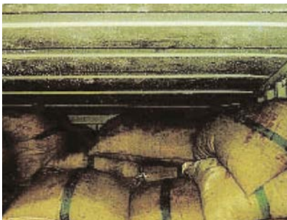
Figure 28.2: Condensation from the container roof has dripped onto the bags.

Coffee cargoes are sensitive and therefore highly susceptible to taint. Cleanliness of the cargo hold/container is important. Care should be taken not to damage the coffee by fumigation and also to keep the coffee away from exposed internal surfaces with the use of paper.