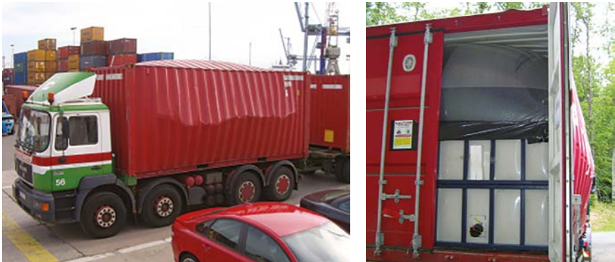
Figure 34.8: Damage caused by fermentation of wine.

However, problems do arise, such as with wine which expands excessively if it ferments in a flexitank, see Figure 34.8.