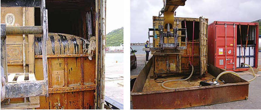
Figure 34.7: Flood-damaged flexitanks containing undamaged latex.

A flexitank can sustain severe trauma without leaking. Figure 34.7 shows a flexitank full of synthetic latex stowed at the bottom of a flooded hold. There was no leakage and the product was later sampled, approved and discharged for its intended use.