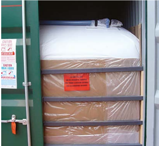
Figure 34.5: Use of protective cardboard sheets.

To ensure that a flexitank does not bulge through the gaps in a steel framework bulkhead, a sufficiently rigid sheet should be placed on the inside of the bulkhead. This prevents the flexitank chafing against the steelwork. Figure 34.5 shows horizontal steel bars used with cardboard sheeting placed between the flexitank and the steel bars.