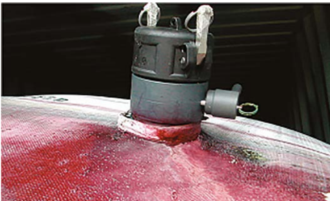
Figure 34.6: Flexitank valve.

For ease of discharge, bottom fittings adjacent to the doorway are generally preferred. However, this can result in a static head of pressure between the flexible body of the tank and the valve construction. Leaks can occur due to the detachment of the double patch around the valve opening of either the top or bottom fittings.