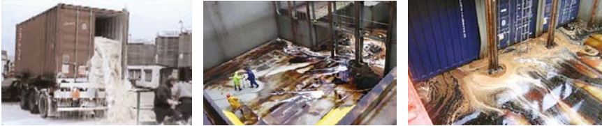
Figure 34.3: Flexitanks damage.