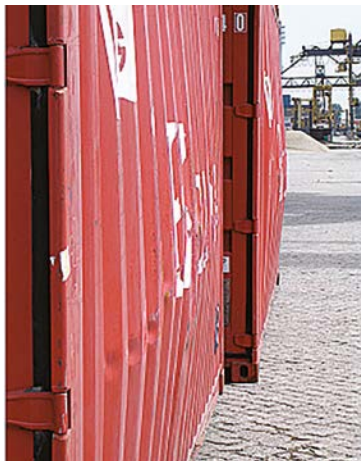
Figure 34.2: Bulging flexitanks.

A large number of claims have arisen relating to containers carrying flexitanks, where the pressure placed on the sidewall panels inside the containers has resulted in them bulging beyond accepted ISO external dimensions and tolerances, leading to permanent deformation. The International Organization for Standardization (ISO)/Institute of International Container Lessors (IICL) deformation limit for sidewall panels is a maximum of 10 mm beyond the plane of the side surfaces of the corner casting fittings. This limit has been exceeded in many incidents, so some operators have imposed limits on the quantity of liquid that may be carried in a flexitank.