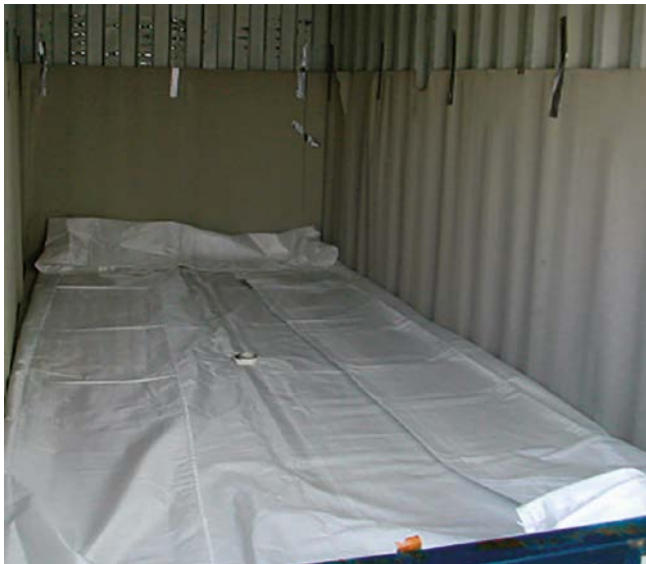
Figure 34.4: Use of kraft paper.

To protect the flexitank from abrasion against bare metal, the normal practice is to line the inside of the container. Materials often used include corrugated cardboard, Styrofoam sheets and kraft paper.