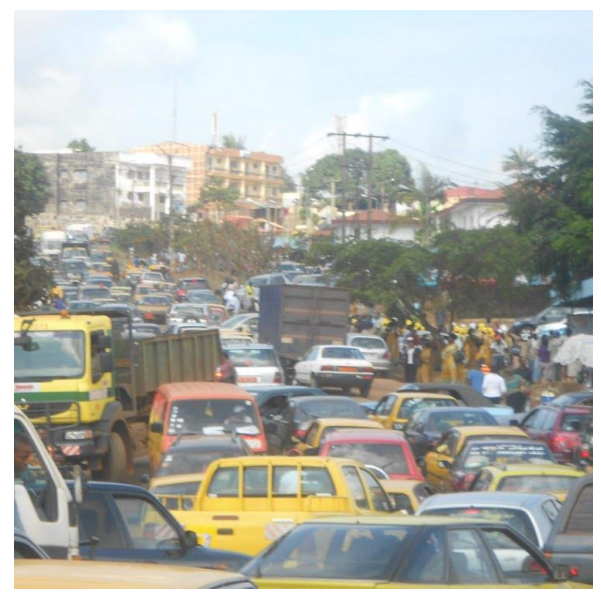
Douala traffic jams

Berths are often congested , forcing the vessels to stay at anchorage for long periods (2 to 3 weeks).