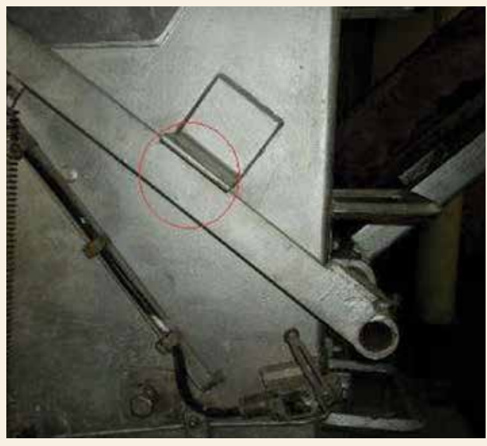
With door open, red circle indicates where crushing ensued

There were no reported difficulties in opening the door, and it is not known why the engineer placed his left hand at the indicated location. The engineer had two prior contracts with the same ship so he was familiar with this incinerator unit. However, the day before the incident there had been an unexpected engine room Unmanned Machinery Space (UMS) suspension. Due to this UMS suspension he had to stand watches in the engine room and as a consequence had inadequate rest for the period leading up to the accident.