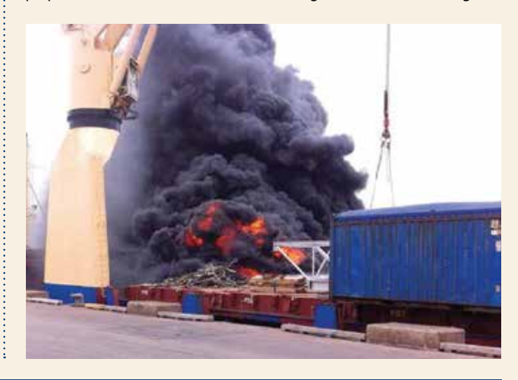
Visit www.nautinst.org/MARS for online database

→ In preparation for hot work by shore workers the crew placed three fire hoses, two dry-powder fire extinguishers and a number of fire blankets in the hold. As gas-cutting began no fire watch had been established at the hot work site(s) inside the cargo hold. A tarpaulin cover caught fire, and the shore workers raised the alarm. None of the ship's crew were in the hold and there was no attempt to use a fire extinguisher or the other fire-fighting equipment that had been prepared. The chief mate saw smoke coming from number one cargo