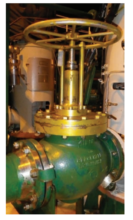
Spindle valve assembly