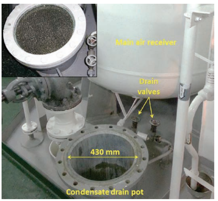
Drainage pot arrangement. Inset shows observation glass in place.

→ The fourth engineer started his engine room checks, which included draining accumulated water (condensate) from the main and auxiliary air receivers. He opened each of the two inline drain valves of the forward main air receiver about one turn and stood by, watching the