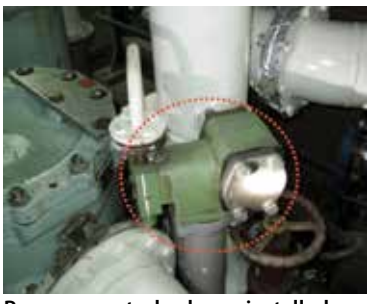
Pressure control valve as installed