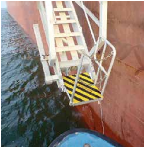
Bottom platform not horizontal

Sometimes the bottom platform has not been adjusted to suit the ship's draught. The bottom platform should be as close to the horizontal as possible to ease access and increase safety.