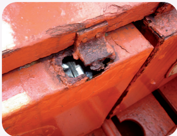
Corroded stores compartment