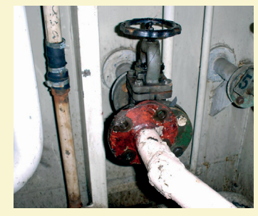
OWS test run