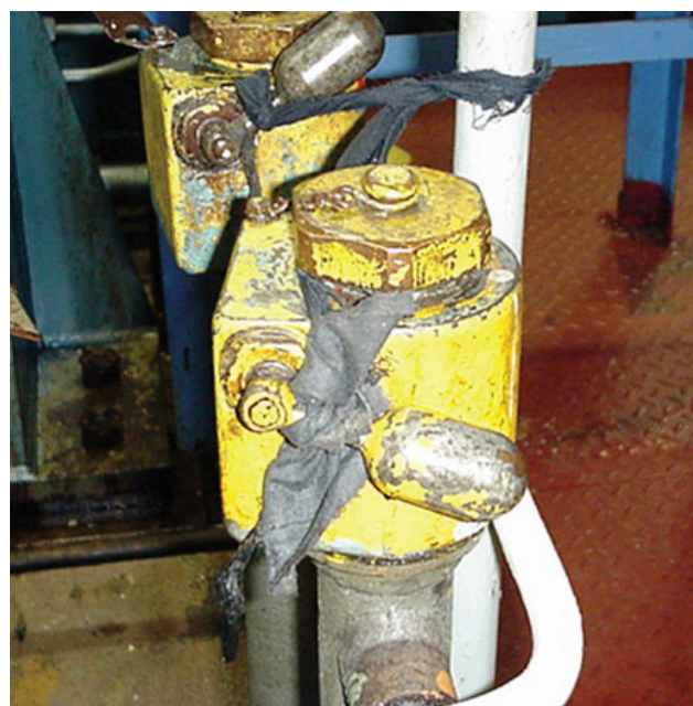
Sounding pipe lashed in an open position

This practice can potentially place the vessel in a hazardous situation: