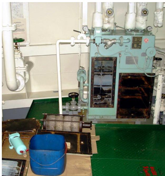
OWS opened for maintenance

Capacities of equipment and serial numbers noted on the IOPP certificate should be verified. It was found on one ship that the rated capacity of an incinerator on the ship's IOPP Certificate was different from the capacity stamped on the incinerator's identification plate. It is suggested that the