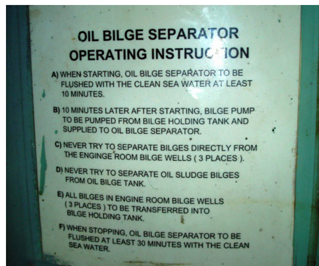
Clear to read

Manager's instructions and service manuals concerning the OWS and related equipment should be maintained on the ship. It is mandatory that proper operating instructions and an operating diagram are posted on the OWS unit. These should be as clear and simple as possible. It is a STCW convention requirement that engineering officers receive the mandatory minimum training required by the provisions of Annex 1 of MARPOL 73/78.