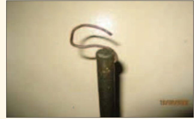
▲ Figure 3: View of open wire tail fitted on handle's free end for hanging spanner

5. Wheel keys should be fitted with non-hazardous hanging/ securing arrangements.