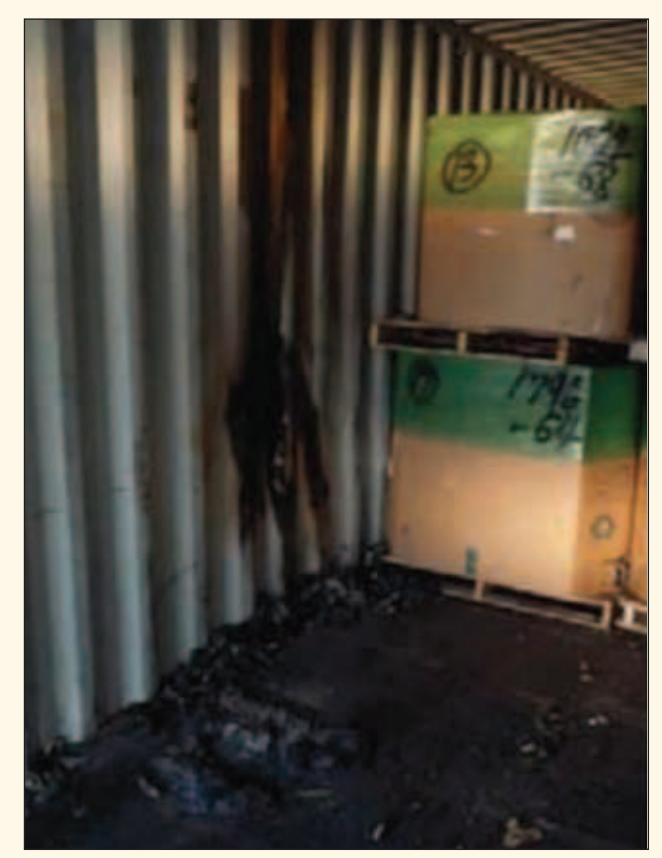
▲ Figure 6: Heat damage to inner surface of container's side panel