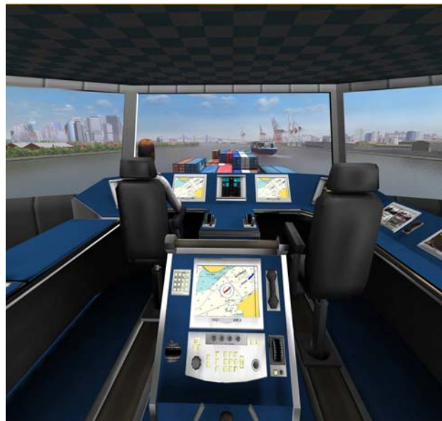
Illustrations by C Smart