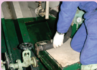
Illegal pipe - sludge pump to overboard