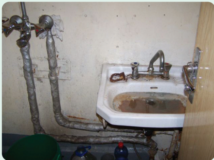
Sanitary facilities not fit for use