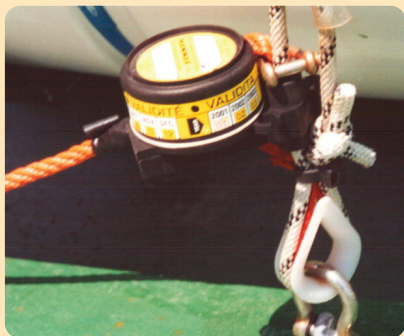
Correctly mounted Hydrostatic Release Unit (HRU) on an inflatable liferaft