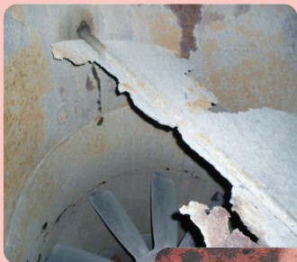
Wasted engine room fire damper