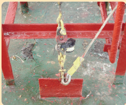
Incorrectly mounted HRU on an inflatable liferaft. The painter should be attached to the HRU