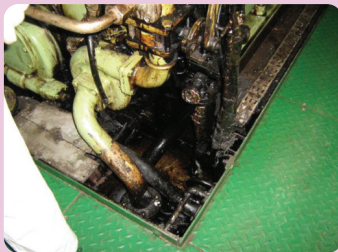
Leaking auxiliary engine