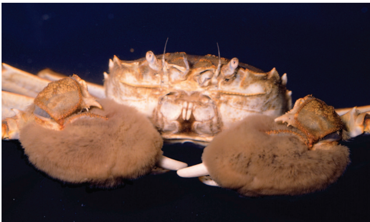
Eriocheir sinensis Known as the Chinese Mitten Crab, Big Sluice Crab or the Shanghai Hairy Crab, this is a medium-sized burrowing crab with furry claws that look like mittens, hence the name. It is native to East Asia but has been introduced to Europe and North America where it is considered one of the world's worst invasive species.

The UK P&I Club have set up an International Environmental Compliance page 5 on our website, and members are directed to this page for additional information.