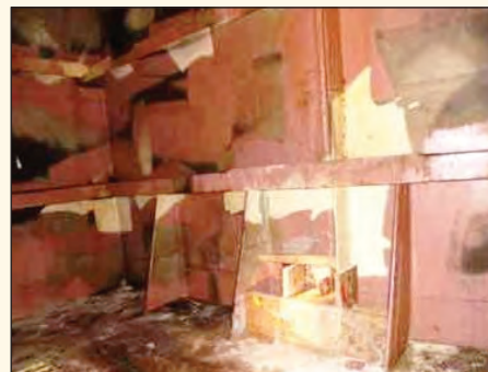
◀ View of temporary repairs showing cement box within retainer plate wedged between stiffener brackets

■ Editor's note: Whilst this defect may not be considered to directly affect the water-tight integrity of the vessel, an internal leak from a COT into SBT has serious environmental implications. Though the report does not mention it, the discovery of the internal crack was presumably communicated to the classification society, port state and flag state by the Master or by the management (Ref. MARPOL Annex 1 Regulation 6.4.3). Classification society rules also require that even temporary repairs to such defects are carried out only with prior approval, and often under a surveyor's supervision. For any hull defect, crew must firmly