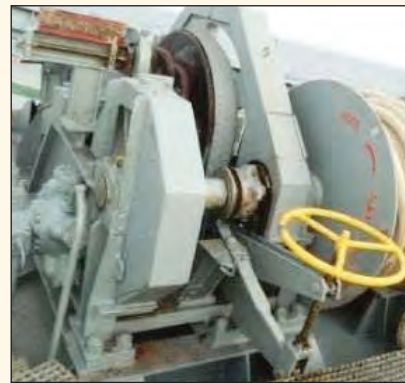
◀ Preventative action completed – steel plate guard made and bolted over gap between gear wheel guard and winch shaft bearing support bracket