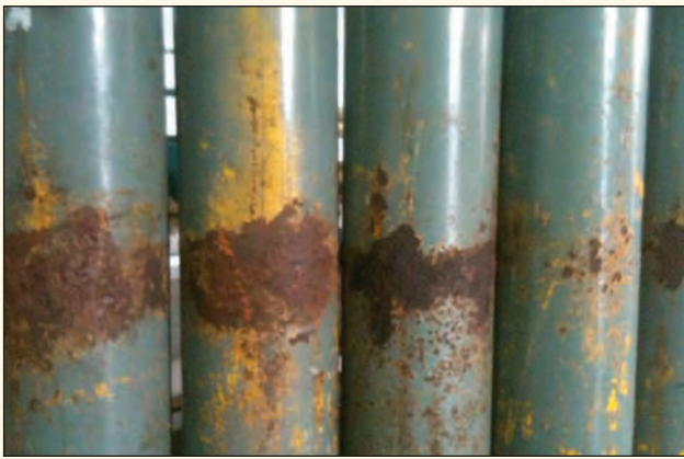
▲ View of localised corrosion on the exterior of air cylinders

An oil tanker's totally enclosed fibreglass lifeboats were equipped with high-pressure air cylinders stowed beside the keel. One day at sea – shortly after the lifeboats had undergone a 5-yearly inspection by an accredited contractor – one of the compressed air cylinders suddenly and spontaneously burst, resulting in extensive damage to the lifeboat's keel and hull. Fortunately, no-one was injured. Once