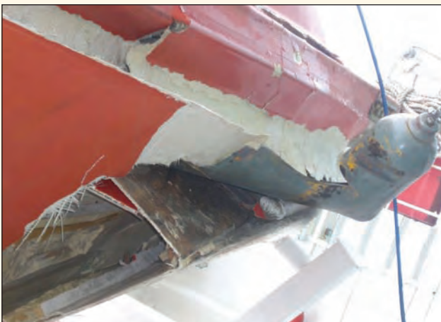
▲ Close-up view of damaged hull and ruptured air cylinder

the vessel arrived in port, a local lifeboat service company was contracted to investigate the incident and assess the damage with a view to carrying out repairs. In the absence of supporting documents (certificates/ work reports etc.) and from the dates punched on the cylinders, it appeared that it was more than six years since the last hydraulic test of the air cylinders. (IACS Recommendation No.88: Air bottles for air supply in totally enclosed lifeboats should be hydraulic pressure tested by a competent service station recognised by a Recognised Organisation at intervals not exceeding 5 years and the hydrostatic test date must be permanently marked on the bottles.) The substantial corrosion of the cylinders' exteriors suggested that routine inspections and maintenance had also been seriously neglected. After the air cylinders were removed and closely examined, it was ascertained that the cylinder shells had suffered a 50% diminution in thickness in the corroded patches.