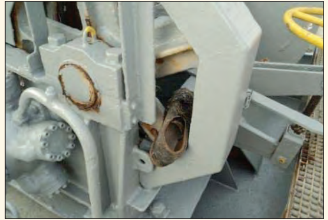
▲ Reconstruction of accident showing how OS's right foot was trapped between a rotating spoke, gear wheel guard and winch shaft bearing support bracket

A steel guard plate was fabricated and fitted over the gap existing between winch shaft bearing support bracket and peripheral gear wheel guard.