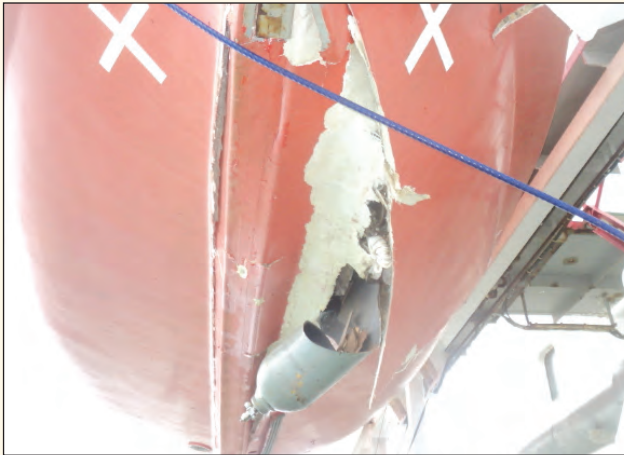
▲ View of damaged hull and ruptured air cylinder