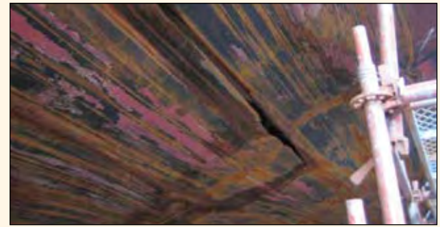
▲ View of bottom damage

4. Adjusting ETA by stopping in open water at the start or during a passage tends to reduce flexibility later. It is good to have time in hand when busy waters with hidden dangers lie ahead.