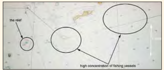
Paper chart showing planned track and the reef